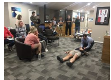
Concussion Testing Protocols

The Train the Trainers Night is aimed at sharing the latest best practice information on game day injury support across both junior and senior football. Participants received information on concussion testing protocols, practical advice on foam roller usage as well as the latest taping techniques.