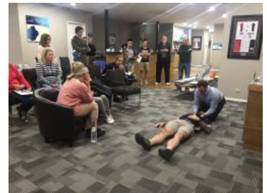
Concussion Testing Protocols

The Train the Trainers Night is aimed at sharing the latest best practice information on game day injury support across both junior and senior football. Participants received information on concussion testing protocols, practical advice on foam roller usage as well as the latest taping techniques.